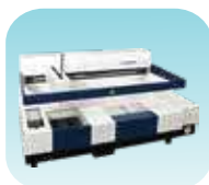
Fully Automated CLIA