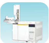
Optima Gas Chromatograph 3007