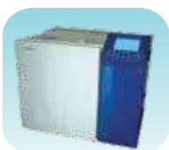
Optima Gas Chromatograph 2979 Plus