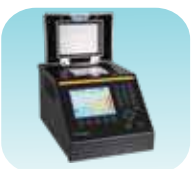
PCR/Gradient PCR/ RTPCR