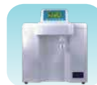
Water purification system