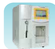
Liquid Particle Counter