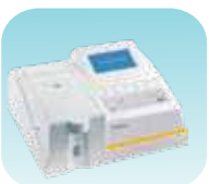
Semi Auto Bio Chemistry Analyzer